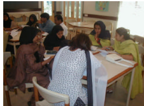
Participants doing group work at "Collaboration and Teamwork for School Improvement" during the PAIE session

We as a team decided to work on (a) The Circle of Friends (b) The Communication Diary