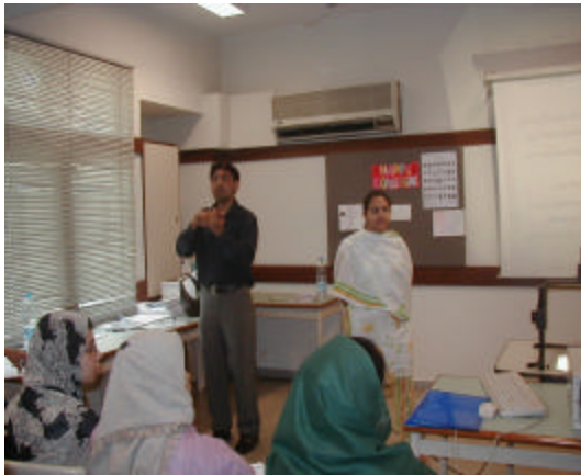
Sign Language Interpreter signing for Deaf Participants during the collaborative session of PAIE with HEAR ME on Hearing Impairment